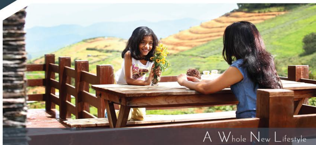
A Whole New Lifestyle