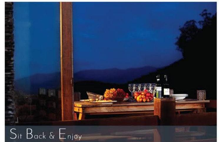
Sit Back & Enjoy